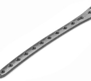
Locking Plate 5.0 Distal Femoral Plate