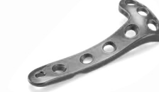
Locking Plate 5.0 Lateral Proximal Tibial Plate