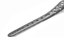
Locking Plate 3.5 Medial Distal Tibial Plate